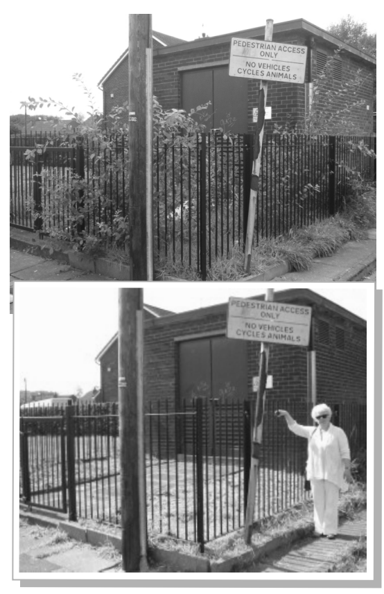
One of the Ward's sub-stations before and after the clean-up